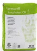
ArmaProtect CM Firestop mortar